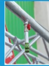
The nozzles have different diameter options. These nozzles can be activated and deactivated by valve.