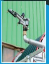
The sprinker (Mariner from Italy) on the wing increases the irrigation distance.