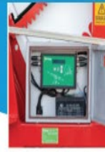
The electronic control unit has different language options.